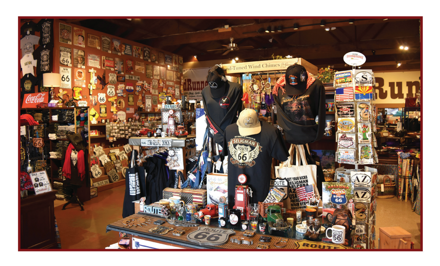
Our Gift Shop is Unmatched and Features a Wide Selection of Route 66 Memorabilia, Clothing, & Handcrafted Original Artwork and Jewelry from Local Artists and Native American Craftsmen